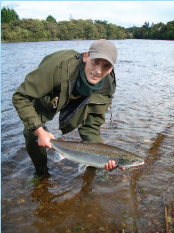
A fresh grilse from the Mill Stream

Inverness Angling Club, whose members have included some of the most innovative anglers of successive generations, manages the publicly-owned Ness fishings which run for some three miles from the top of the Red Braes Pool to enter the Moray Firth near the Kessock Bridge. The club fishings have delivered years of pleasure for local, UK and overseas anglers, producing fine catches of salmon and grilse.