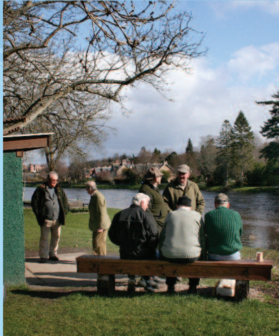
Little Isle chat