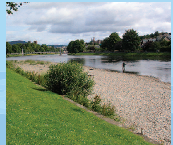
The Little Isle Pool

Before your outing, please take a few minutes to read the rules regulating our fishings. You will find these printed on the back of the visitor permit. All spring salmon must be released, regardless of condition. From June 1 anglers must release alternate fish to continue their spawning run. Enjoy your fishing. Tight lines!