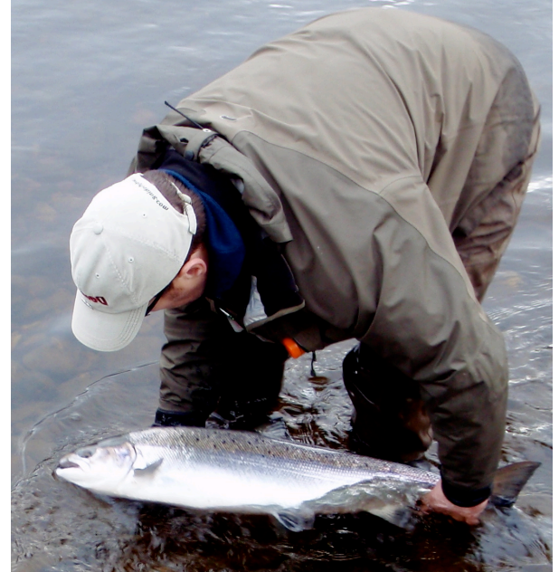
January Springer released on the Newtyle Beat, River Tyne in 2011

Consider the speed the fly is coming through the stream. If you are fishing a fast, streamy pool, think about mending the fly line upstream once it enters the water. This will have the effect of slowing down the speed the line swings through the pool and the opportunity for the fly to get out amongst the fish. Best